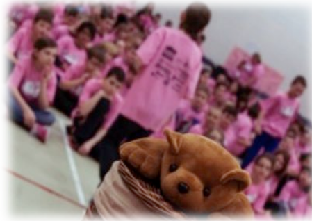
Pink Shirt Day February 2014